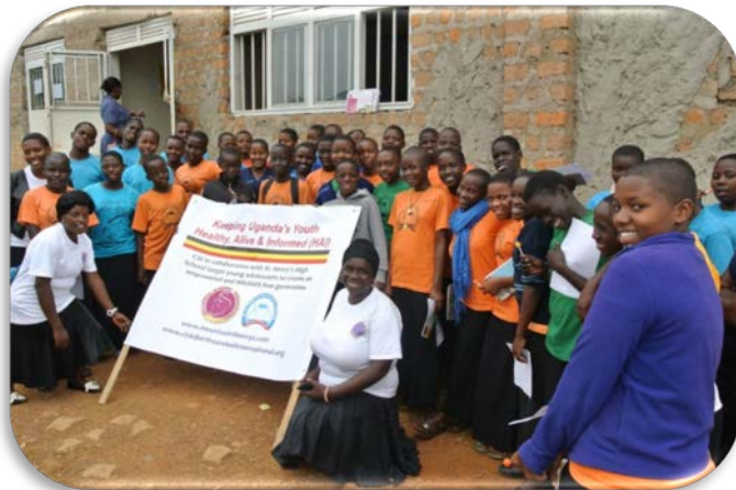
CSI Uganda: Launch of Keeping Youth Healthy, Alive, & Informed (HAI) program at Mt. St. Henry's Mukono High School.