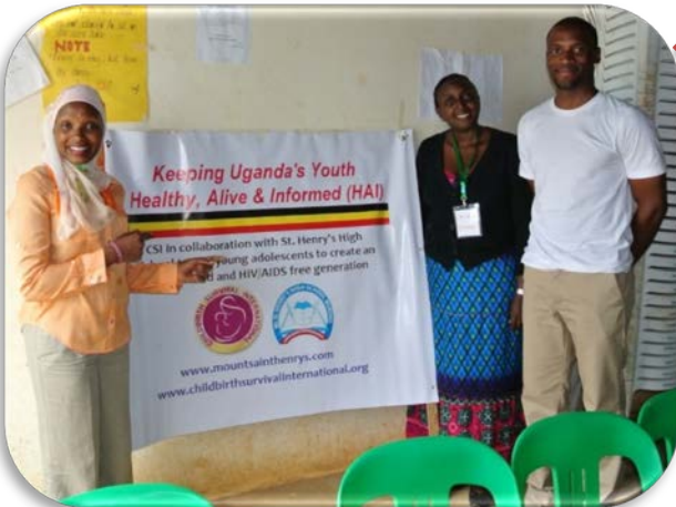
CSI Uganda: St. Henry's High School Executive Director (m) and CSI key note speakers: Girl-child advocate (l) and Career Coach (r).

CSI frequently explores more opportunities to establish quality partnerships and collaborations in the US and abroad in order to truly make an impact in the communities served. CSI is a member of the World Health Organization Partnership for Maternal Newborn Child Health and as an organization for the people, CSI strives to go far. CSI is partners and collaborates with White Ribbon Alliance for Safe Motherhood in Tanzania and Uganda, Mt. St. Henry's High School in Mukono Uganda, Profam Royal Clinic in Wakiso, Uganda, & Rotary International . Take a picture tour with CSI's Team! More pictures here .