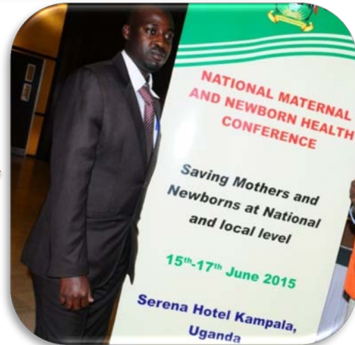
CSI Uganda Public Relations Officer at Uganda's first national maternal and newborn health conference. Men are key in reversing preventable maternal and newborn deaths or disabilities.