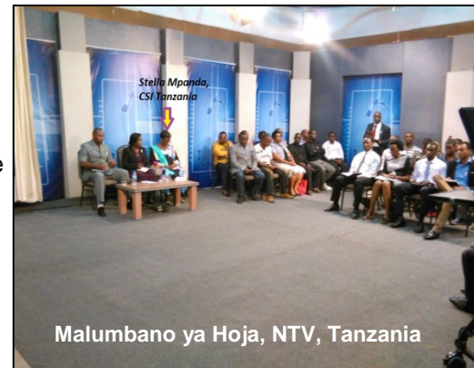
Malumbano ya Hoja, NTV, Tanzania

The ultimate goal is to have more political will and resources directed towards better health services and information for all, especially at the community level.