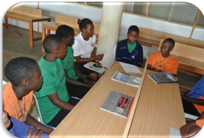
CSI Volunteer facilitates group discussion on reproductive health with students at St. Henry's High School.