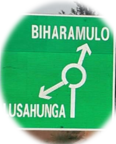
CSI Tanzania is en route to Biharamulo District (Kagera region) to save lives: maternal newborn survival & health. Read more about upcoming fundraising event on September 12 th .