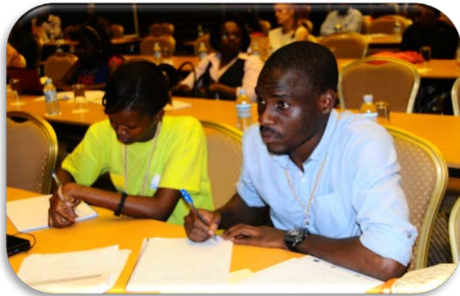
CSI Uganda Photographer at the maternal newborn conference, Uganda.