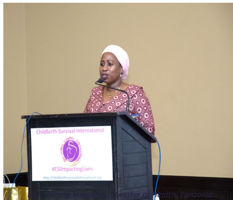
Minister of Health, Tanzania