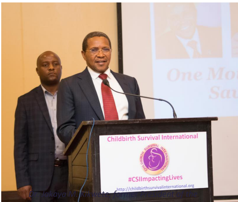
United Republic of Tanzania

An important message from Dr. Jakaya Kikwete, he highlighted the role of global grassroots nonprofits such as CSI—that have a strong and trusted presence in the community and equally contribute in the advancement of national and global health strategies.